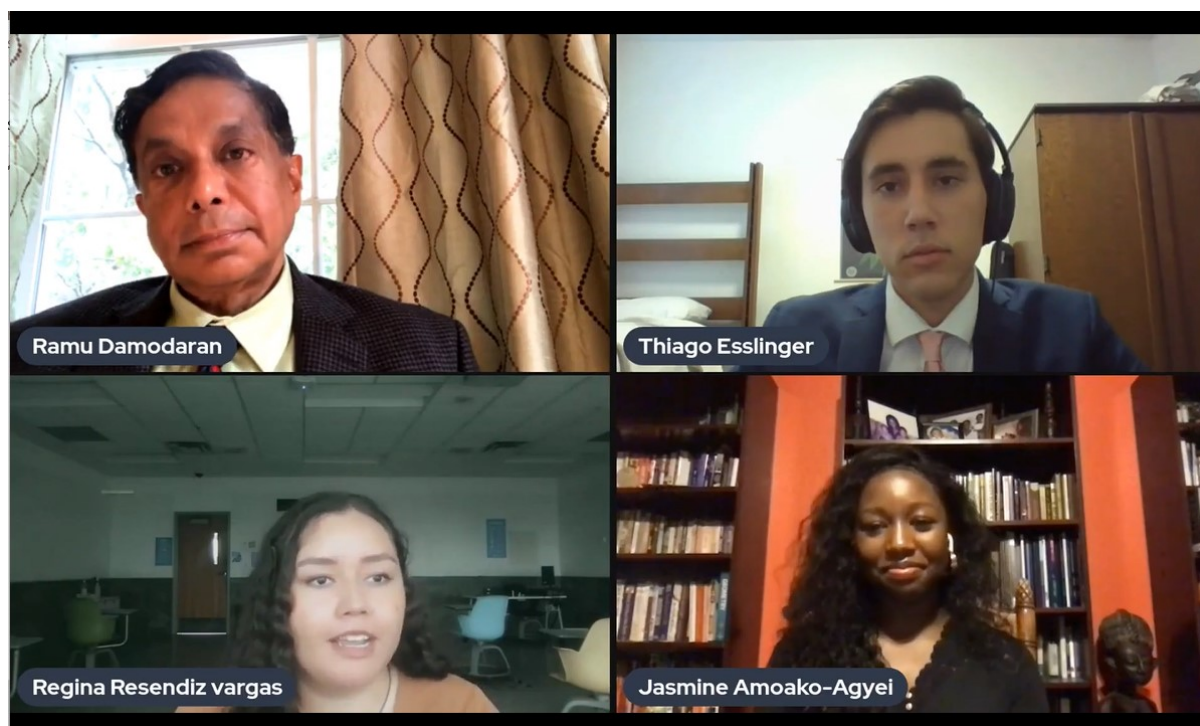
Above: Day 2 Opening Panel featuring Millennium Fellowship fellows.

Food Systems Summit ; SDG10: Reduced Inequalities, addressing global inequalities in race, gender, and access to resources highlighted/deepened during the Covid-19 pandemic; and SDG13: Climate Action, as related to COP26 , the United Nations Climate Change conference. In addition to the three targeted SDGs, this year's gathering had a strong emphasis on youth voices and empowering youth towards global action. The conference committee received session proposals from 27 countries on these and other SDG-related topics.